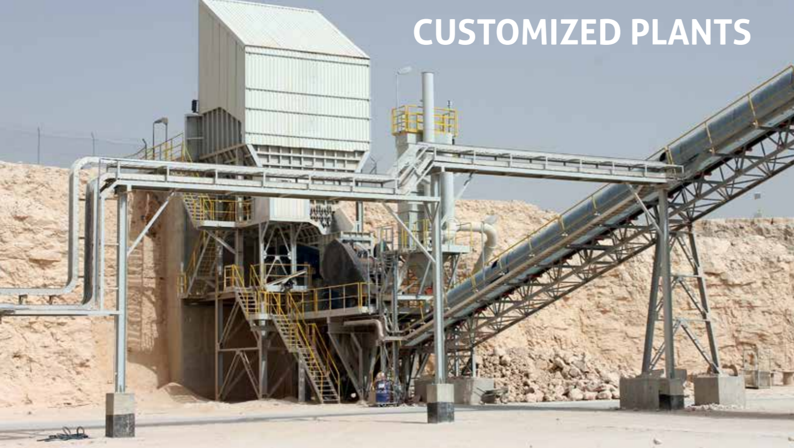
Stationary customized primary plant with feed capacity of 600 t/h