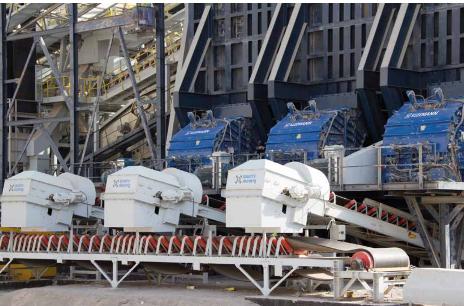
Stationary Customized Plant with feed capacity of 3500 t/h