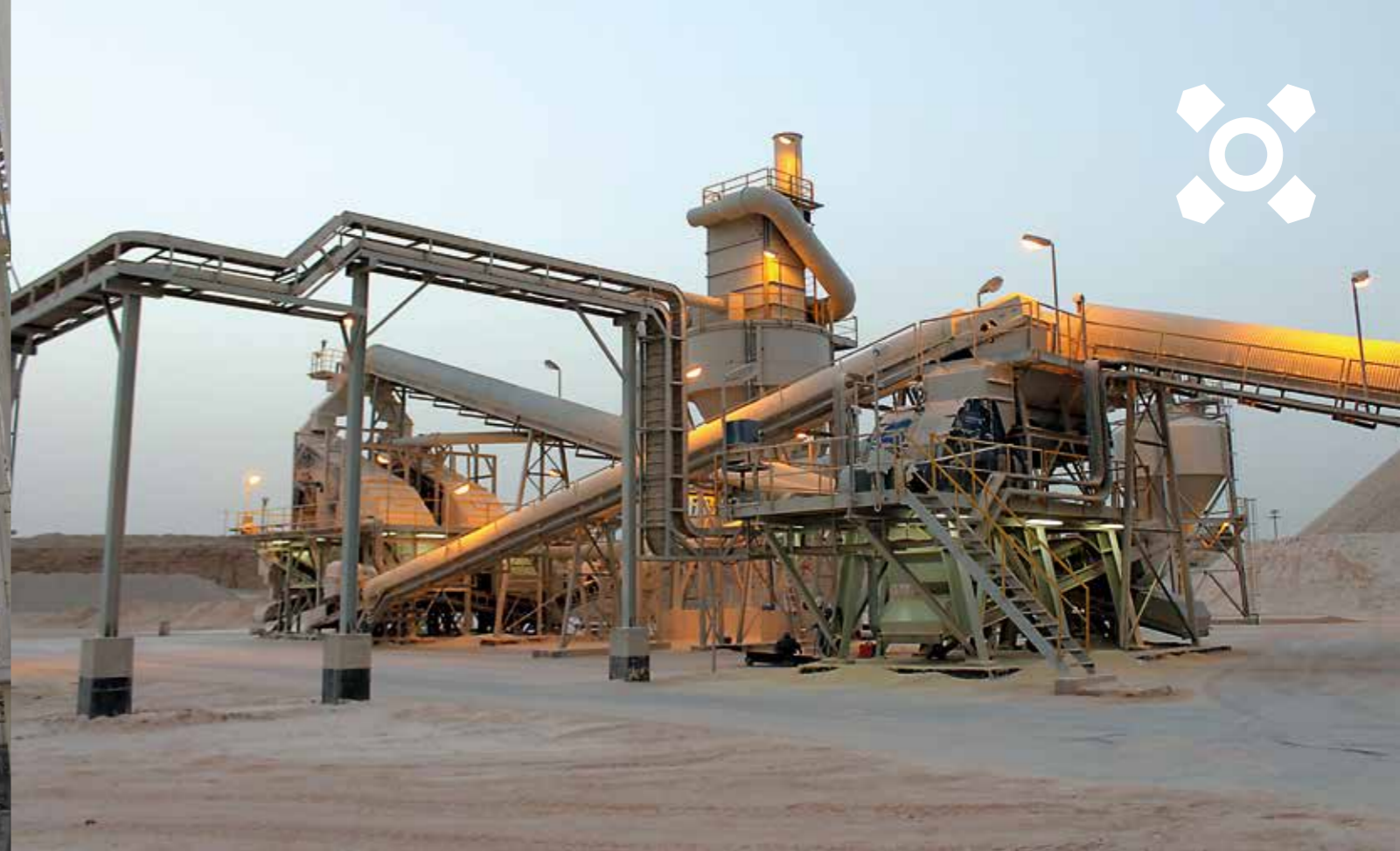
Stationary Customized Plant with feed capacity of 600 t/h