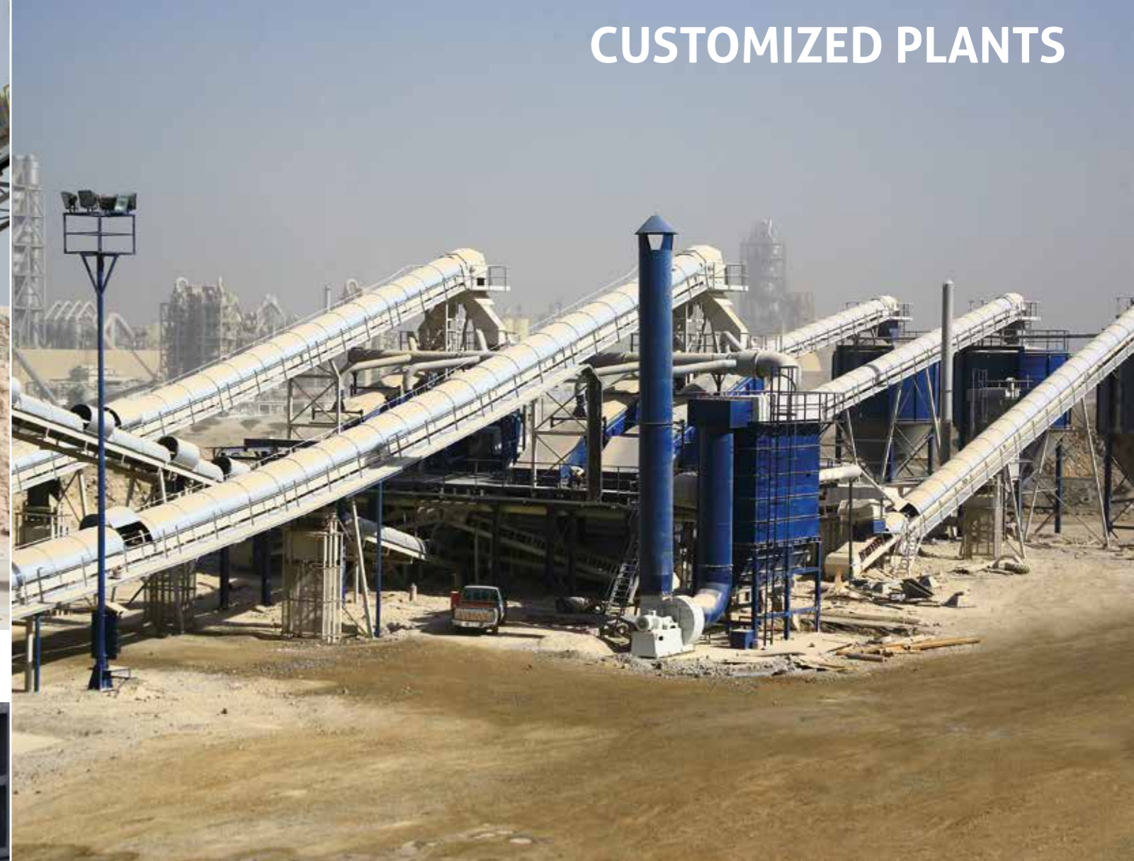
Stationary Customized Plant with feed capacity of 1750 t/h