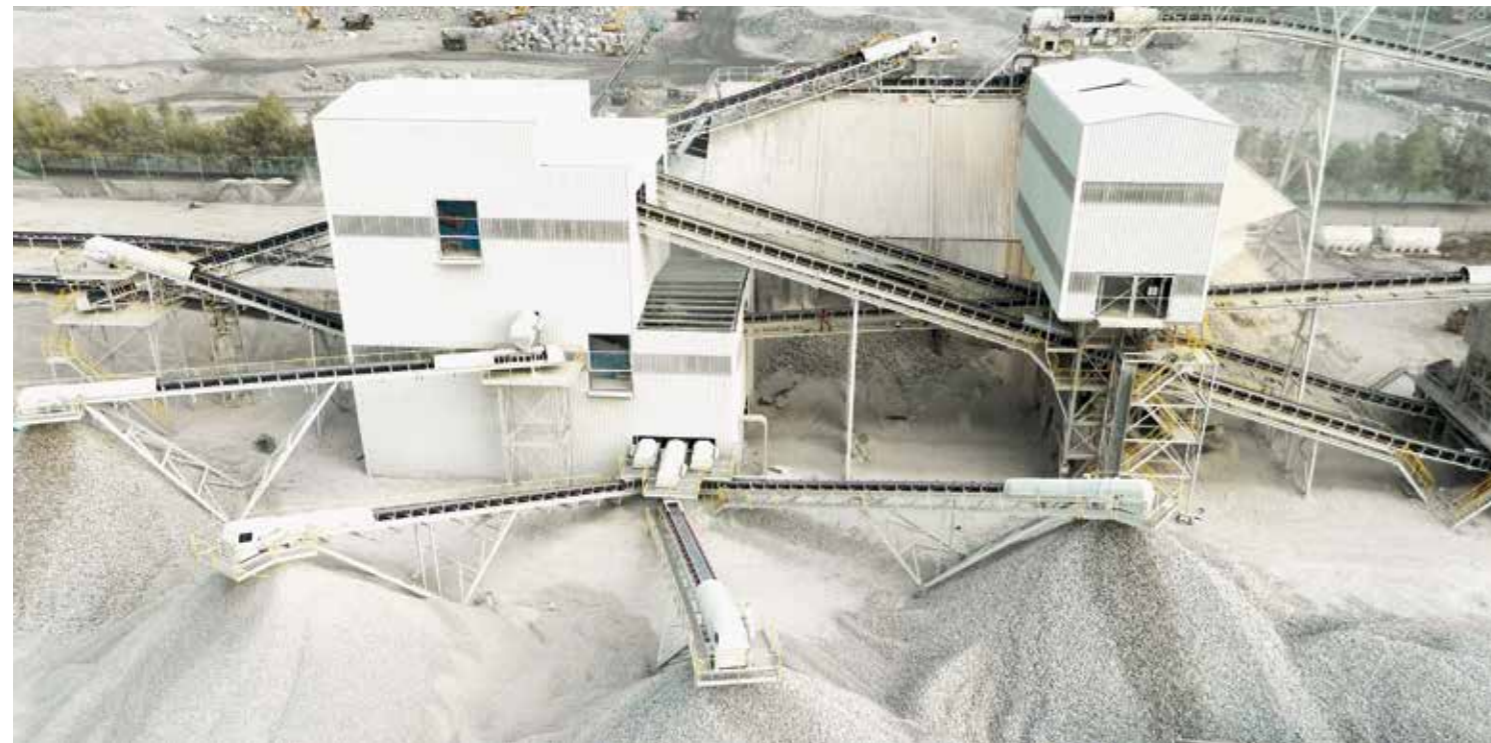
Stationary Customized Plant for production of 40-80mm aggregates with feed capacity of 2500 t/h