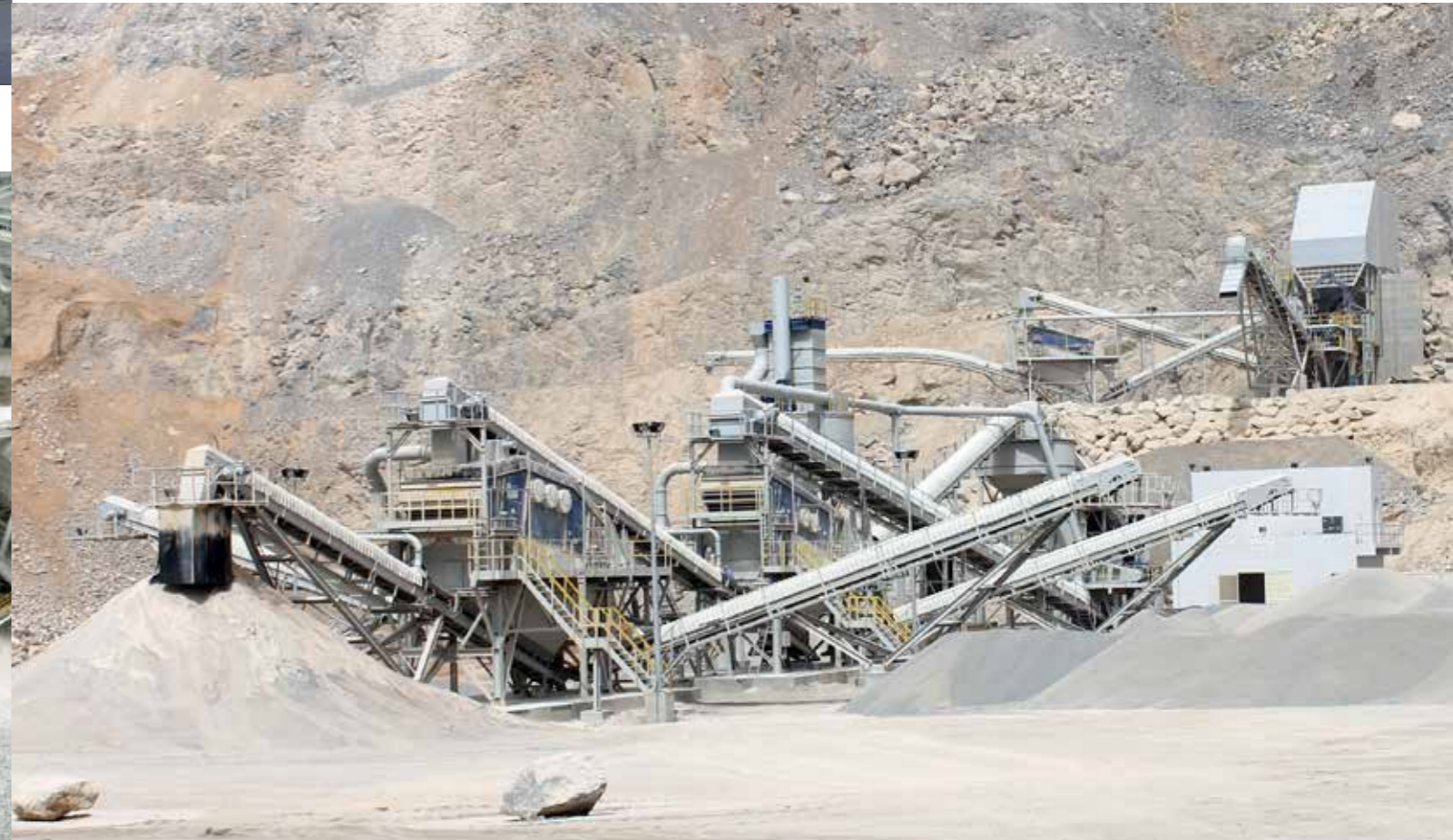
Stationary Customized Plant with feed capacity of 600 t/h