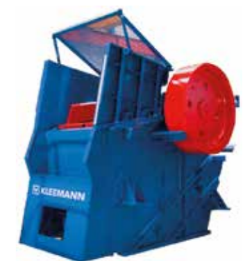
KLEEMANN Crushers and Screens