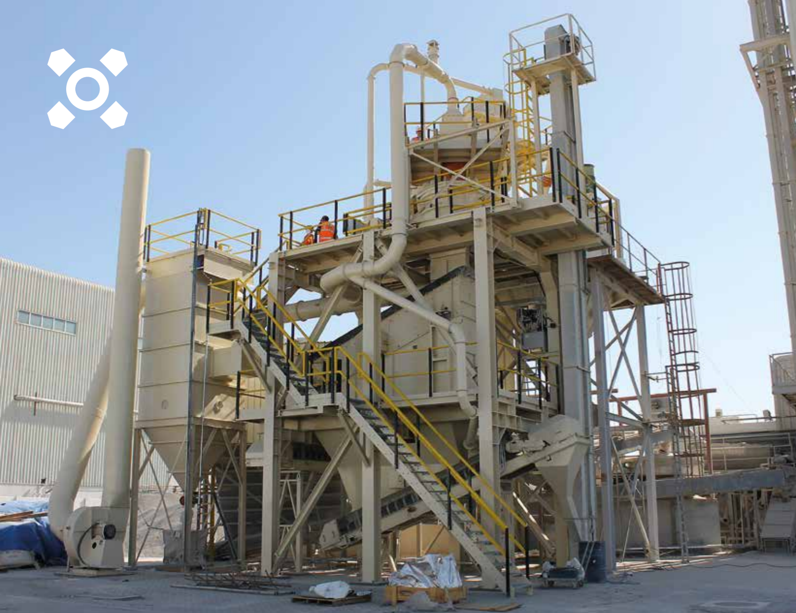
Stationary Customized Plant for fines with feed capacity of 50 t/h